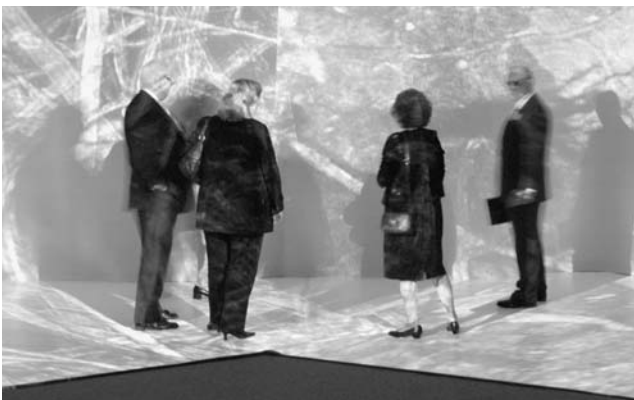
Guests enjoy being inside a piece of paper in Fiberscapes: Experiencing Paper in 3-D , a traveling exhibit from Arizona State University, during the dessert reception at the Paper Discovery Center.